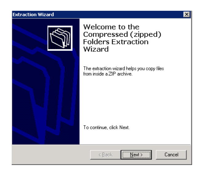
Figure 2.6: The Extract Wizard dialogue