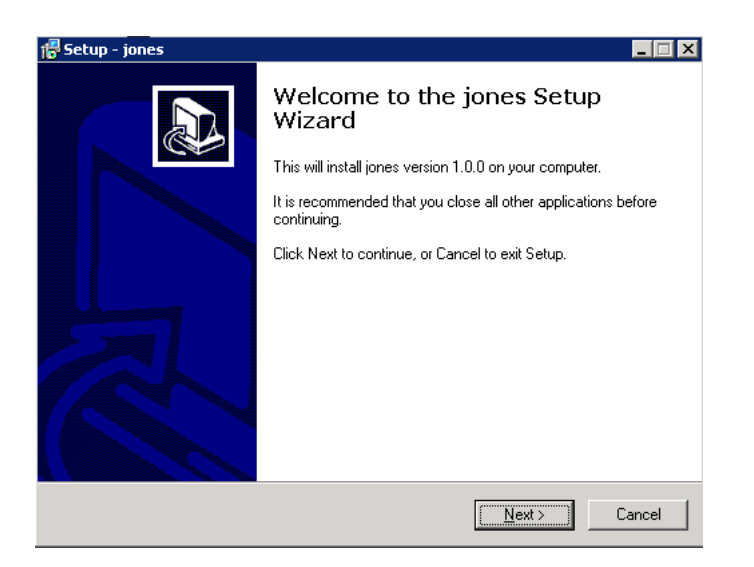
Figure 2.1: Installation dialogue launch