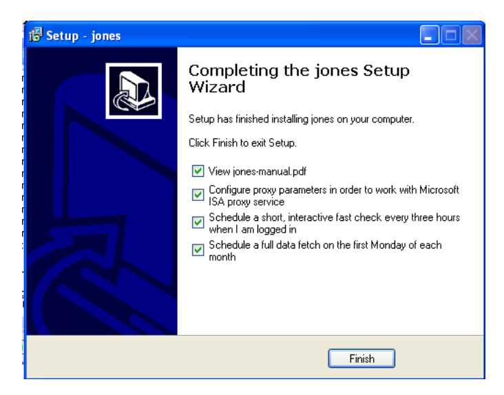
Figure 2.3: Dialogue for creating scheduled jobs, launching this document and configuring proxy settings

If your organisation uses no proxy, or uses another proxy server from any vendor other than Microsoft, untick this checkbox as jones will be automatically detect and use the correct proxy server to use from your environment without further configuration.