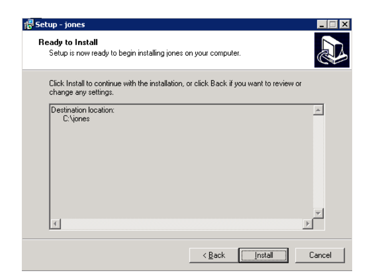
Figure 2.2: jones cannot install into any other directory