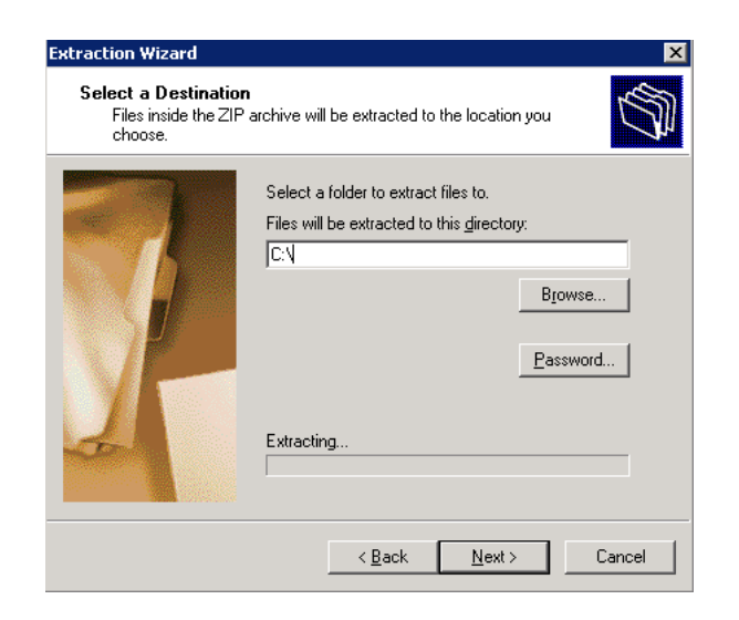
Figure 2.7: Change the extraction location to be C: